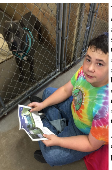
Sweet Pea loves story time

staff and dogs alike. The usual barking has ceased and the only sounds you can hear are the quiet voices of the children reading to their chosen dog. Dogs that can sometimes be protective of their kennels are found laying on their bed, contently listening to a story chosen for them, some even doze off for a nap. Other dogs are so interested they sit at the opening of their kennel and want to look at the pictures and follow along with the story.