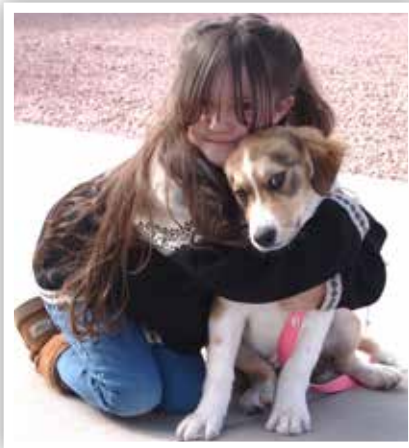
Little girl and her puppy Amata

The holidays are a time for remembering the little things that mean so much, the love of a parent, the smile of a child, and of course, puppy breath. Happy Holidays!