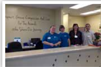
Welcoming staff at HSCAZ