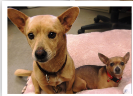
Taco and Fawn