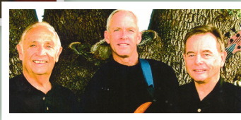
Payson Jazz Trio