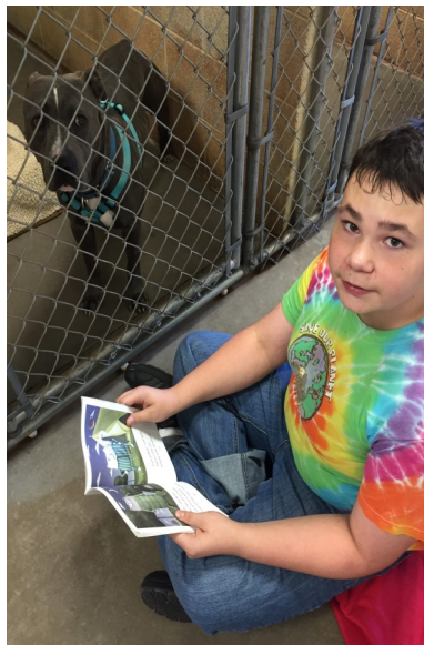
Sweet Pea loves story time

Thursday mornings have become quiet time for staff and dogs alike. The usual barking has ceased and the only sounds you can hear are the quiet voices of the children reading to their chosen dog. Dogs that can sometimes be protective of their kennels are found laying on their bed, contently listening to a story chosen for them, some even doze off for a nap. Other dogs are so interested they sit at the opening of their kennel and want to look at the pictures and follow along with the story.