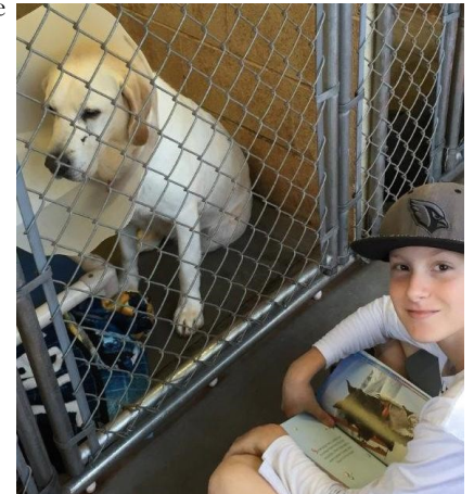
Sundance enjoys a break from the medical staff

This program is benefiting everyone involved. Students are working on their public speaking and reading while the dogs are learning to trust and simply enjoying the extra attention. HSCAZ strives to go beyond the basics and think of the bigger picture by preparing these pets for their forever home. Part of our Behavior Program involves making sure we're finding the right home for each and every animal. "Reading to Rover" helps us see how an animal interacts with a child in advance of a family inquiring about their behavior.