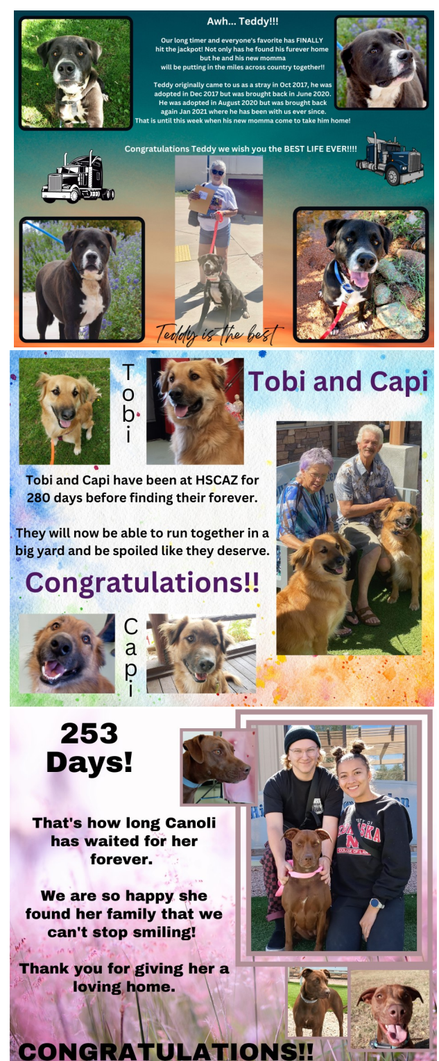
Help our homeless cats and dogs find their forever homes.

Come to our shelter and see if your new best friend is waiting for you! You'll give a homeless pet a home they've been longing for.